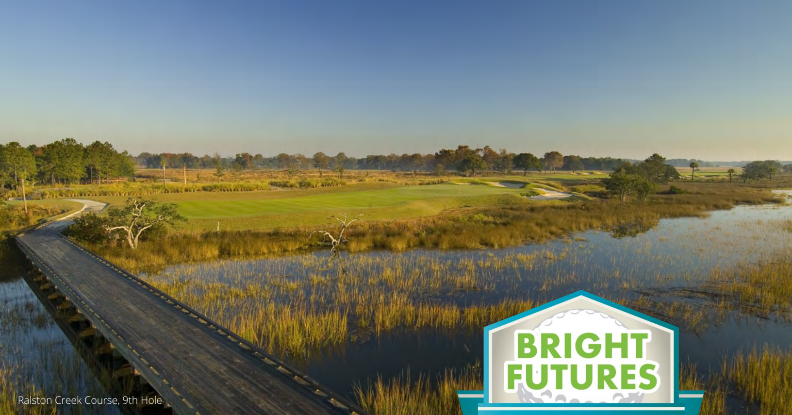
Ralston Creek Course, 9th Hole

Daniel Island Club April 15, 2019 12:30 PM Shotgun Start